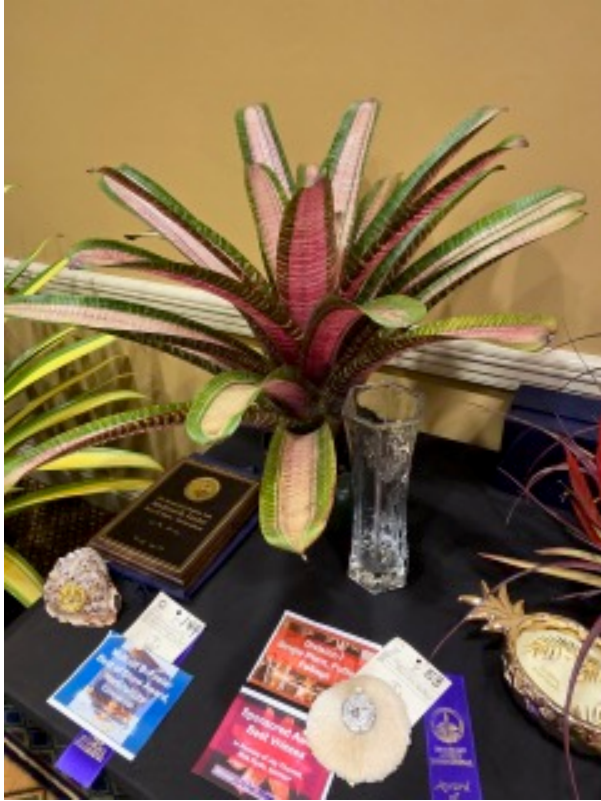
Vr. 'Hawaiian Fantasy'