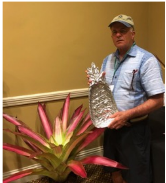
Androlepis 'Party Dress'