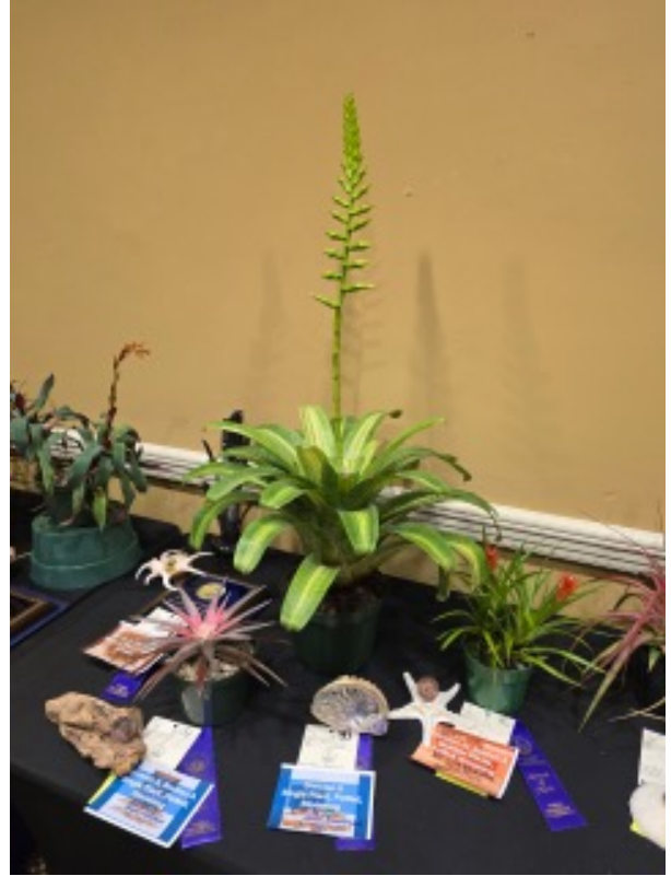
Vr. fenestralis variegated