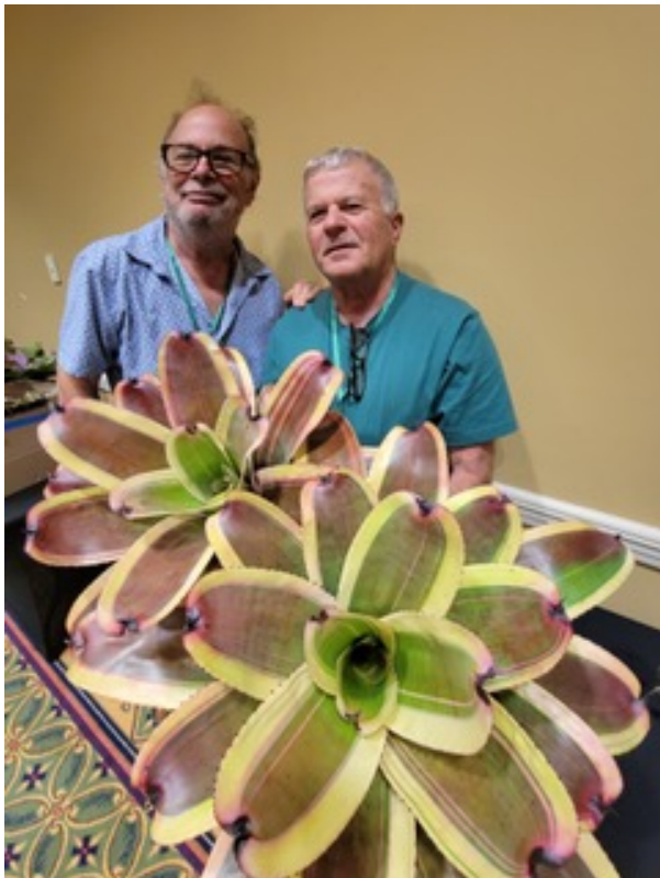
Neo. 'Yukon Jack'